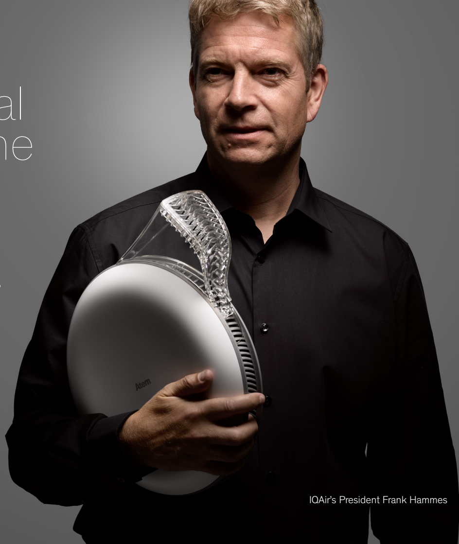
IQAir's President Frank Hammes

“ The Atem is a small but incredibly powerful personal air purifier that removes up to 99% of particles through IQAir’s proprietary HyperHEPA® filtration, including ultrafine particles.